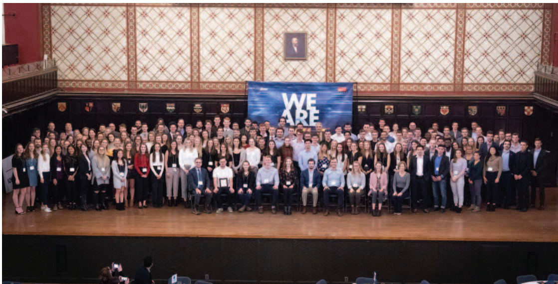
Queen's Athletics & Recreation honoured the 2017-18 Academic All-Stars at a breakfast reception held Wednesday, Nov. 21 in Grant Hall. A total of 365 varsity student-athletes were recognized as Academic All-Stars, having earned at least a 3.5 grade-point average over the past academic year at Queen's. The event marks the seventh year the department has undertaken this initiative to honour the academic and athletic excellence of its student-athletes.

To make a donation online through the United Way's ePledge system, simply go to queensu.ca/unitedway and fill out the forms. Please note that if you donated last year and selected the auto-renewal action, no further action is required unless you would like to change your donation.