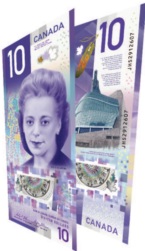
The front of the new $10 bill features an image of Viola Desmond, while the Canadian Museum for Human Rights is on the back.

"What I think is incredible about the choice is that all of us can stand up to injustice, and she did. Every single Canadian can stand up," she says. "The other women (who were considered), they had lots of expertise, deep